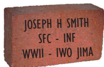
Sample 4"x 8" brick