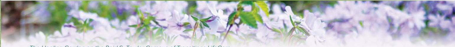
The Healing Garden on the Reid S. Towler Campus of Transitions LifeCare