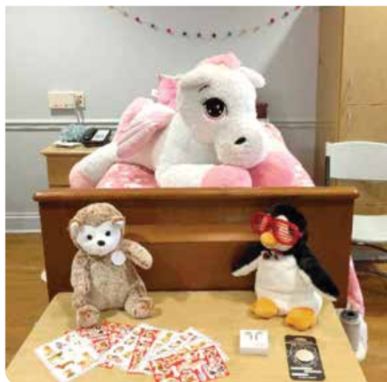
Transitions Kids rooms in our hospice home

Please help us expand and sustain our pediatric program. Through your generous support of this $1.3 million initiative we will expand and address these critical needs for these most vulnerable families.