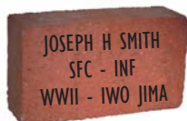
Sample 4"x 8" brick